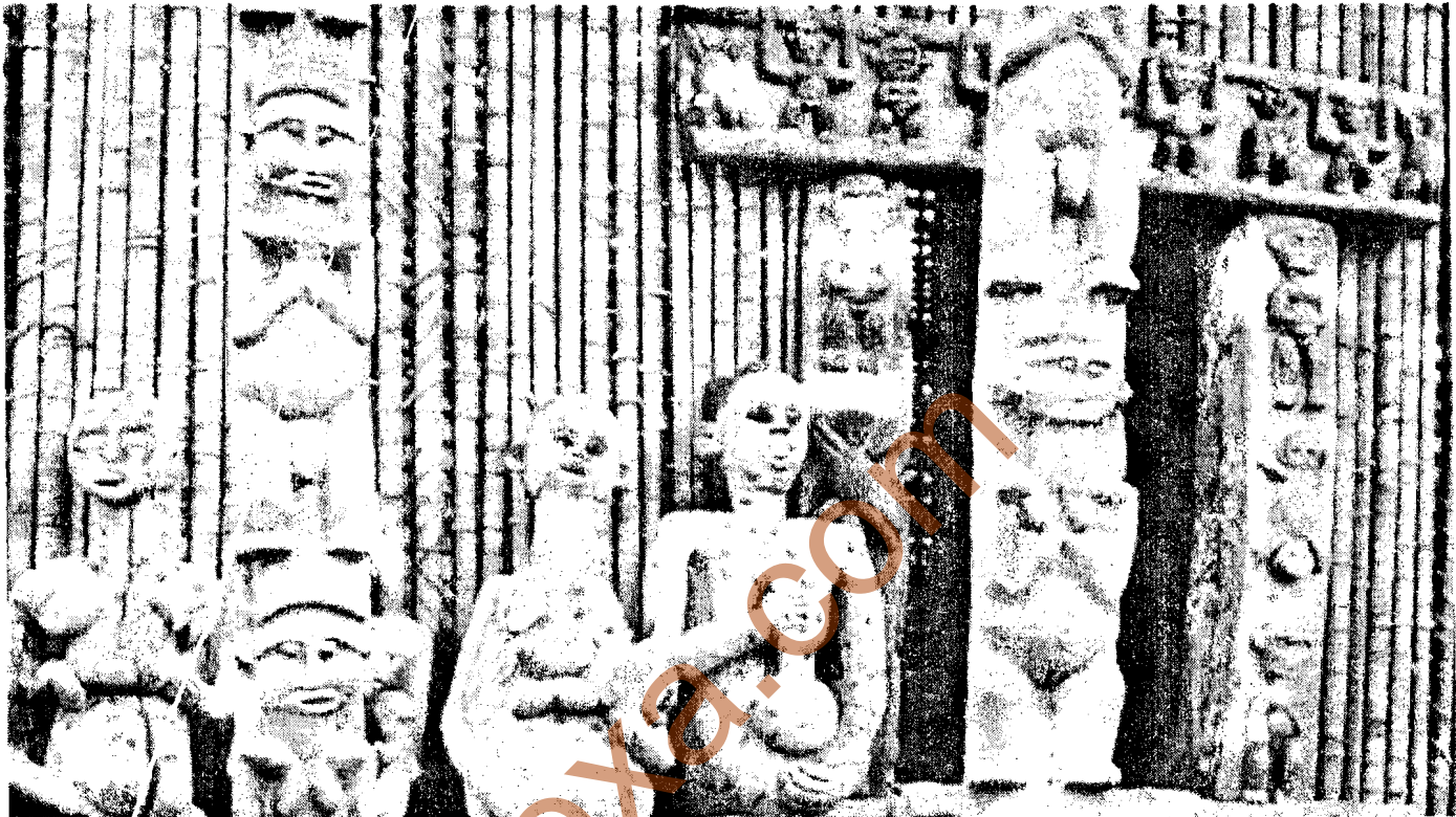
Ancestor figures, carved door frame, and veranda posts on a Bafoussam chieftain's house, Bamileke area, Cameroon grasslands.

of the Bali, which represent elephants' heads, are used in ceremonies for the dead, and the statuettes of the Bamileke are carved in human and animal figures. The Tikar people are famous for beautifully decorated brass pipes, the Ngoutou people for two-faced masks, and the Bamoum for smiling masks.