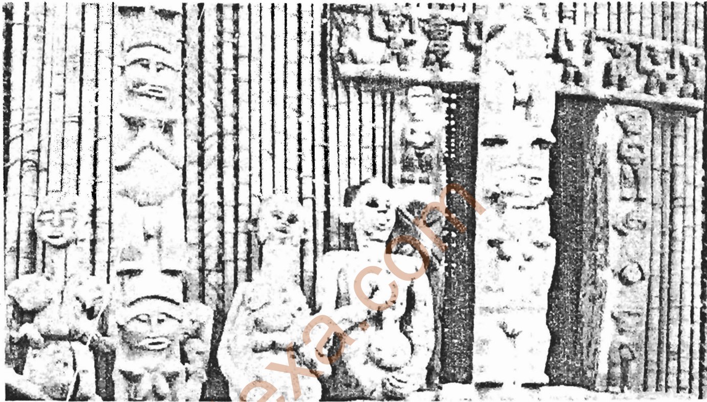
Ancestor figures, carved door frame, and veranda posts on a Bafoussam chieftain's house, Bamileke area, Cameroon grasslands.

of the Bali, which represent elephants' heads, are used in ceremonies for the dead, and the statuettes of the Bamileke are carved in human and animal figures. The Tikar people are famous for beautifully decorated brass pipes, the Ngoutou people for two-faced masks, and the Bamoun for smiling masks.